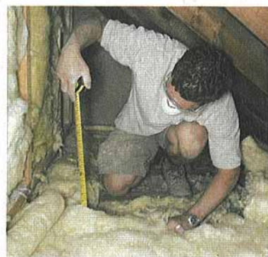
ALMOs can help retrofit energy saving measures such as loft insulation

“The ALMO set-up, its structure, governance and track record in transforming homes up to decent homes standard is a major achievement for the UK.”